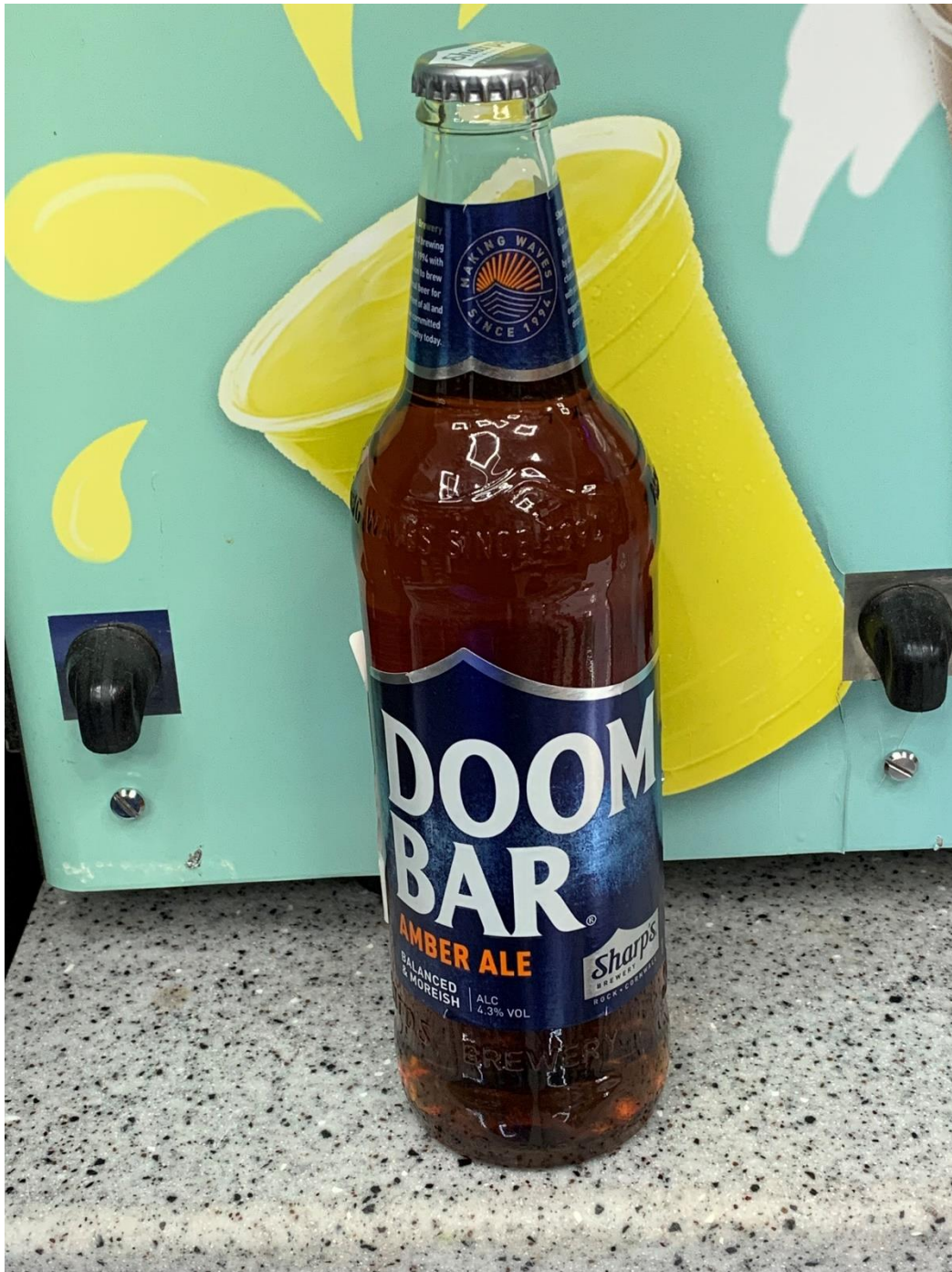
Photo taken on the 30 th January – A bottle of Doombar which a 17 year old police Volunteer was able to purchase from Happy Shopper.